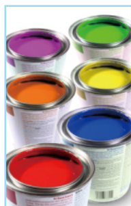
Paint & Ink