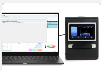
Color management software