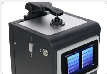
Horizontal or vertical measurement

Micro printer, foot switch, rotating bracket can be freely selected according to the needs.